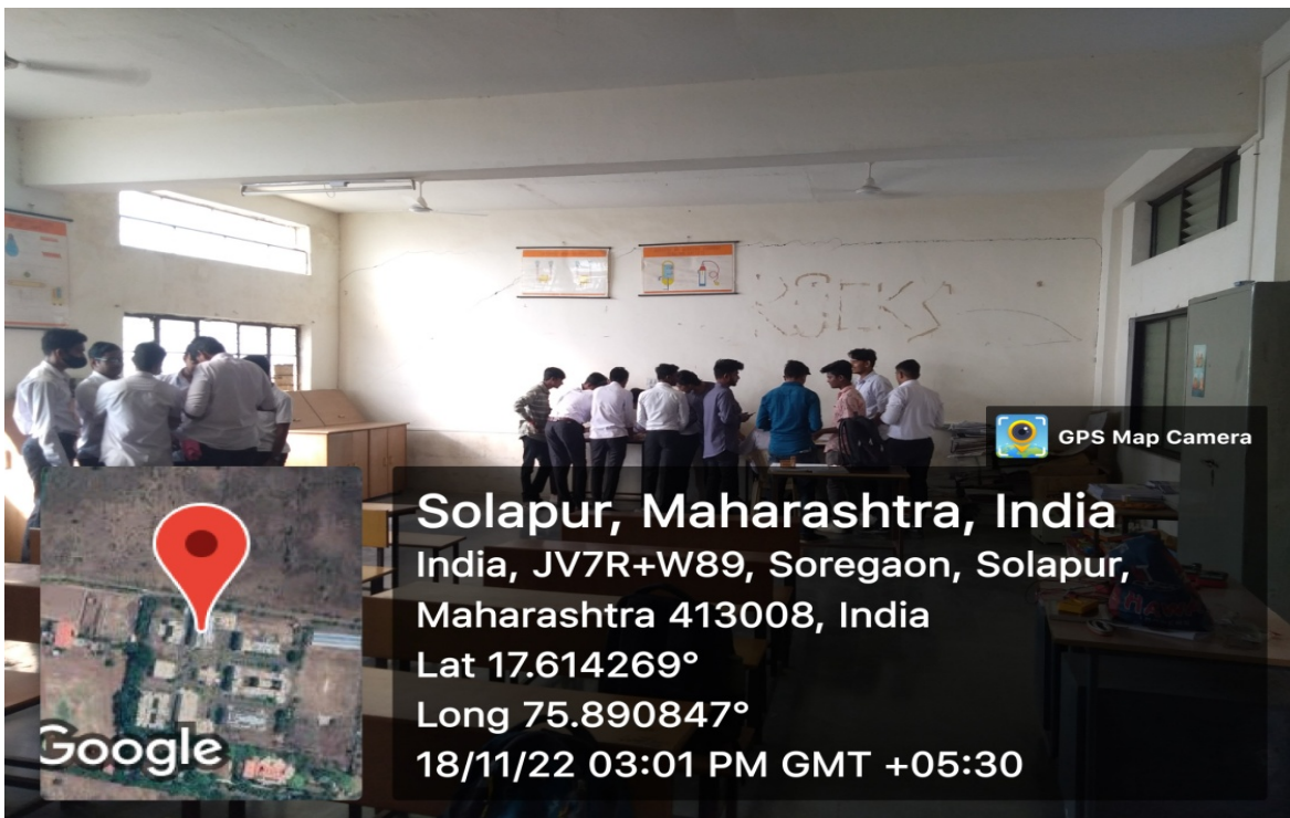
Giving Lab Training to our students by coordinators of Shams Energy