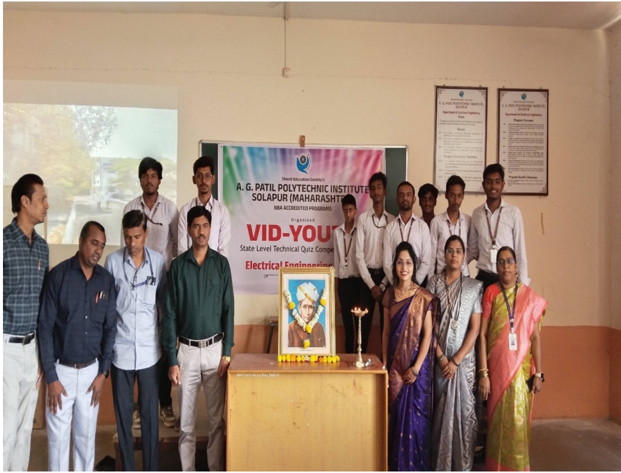
Inauguration state level micro project inauguration of Vid-Youth 2025 Dated 08 th March 2025