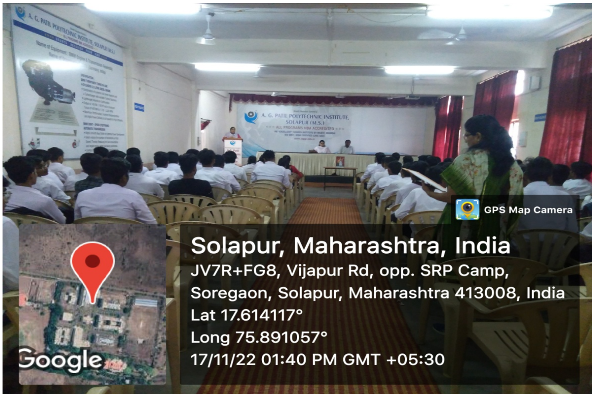
Inauguration function of 3 Day Workshop on “ Solar Energy”